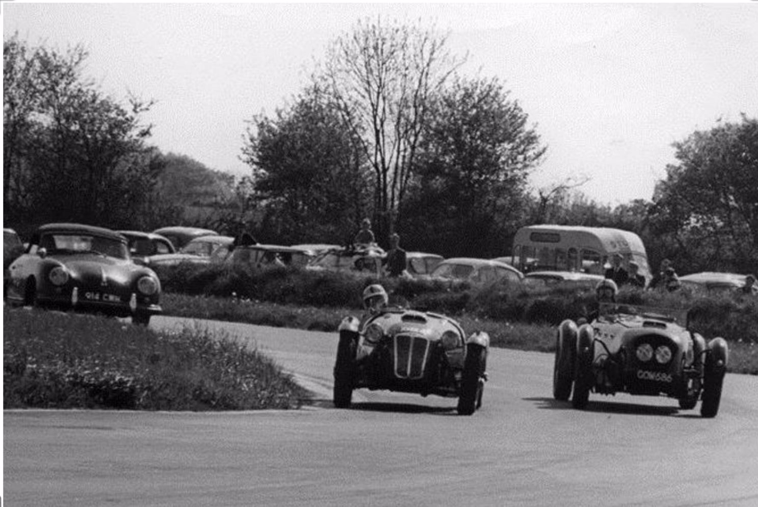
The Historic Sports Car Club , Castle Combe 1966.

The era of the 1950's sports racing cars to many people is the greatest period in post war motor racing. Evocative looking cars of various sizes and capacity's running in circuit & road races through the UK, Europe and the America's. Their country's manufacturers pitting their cars and factory drivers against amateurs, often with one off non production cars in major endurance events. Most of these cars running in those races were all wheel drum braked, long before disc brakes became the accepted standard . The effect of disc brakes gave way to a more confident and faster style of racing and a big step towards the present day where brake fade is a distant memory.