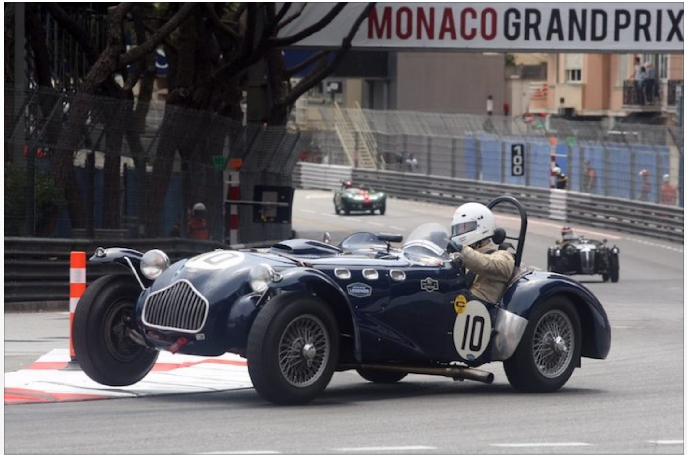
‘ Monaco 2016 ‘ Drum brake 50’s sports cars provide a great spectacle and excellent racing.